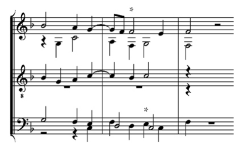
Similar cadential formulas can be found in Nesciens mater virgo (five times), Inter natos mulierum (four times), Ave verum Corpus , Responsum acceperat Simeon , and In illo tempore stetit Jesus . The sources for these motets are Italian manuscripts from around 1530, later German prints, and one Spanish choirbook, so they testify to wide distribution. With the exception of one manuscript, whose conflicting ascription must be called into ques-